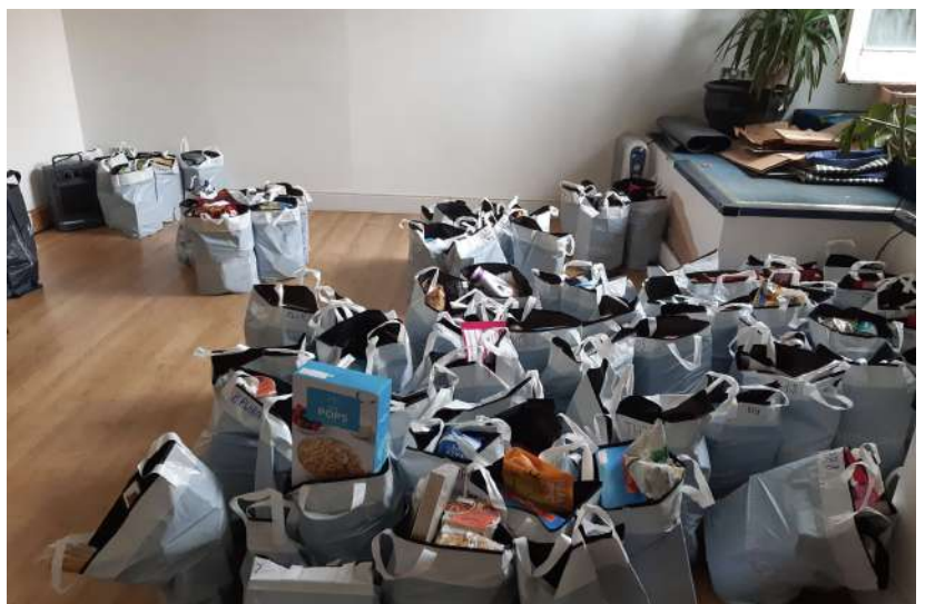
Food parcels for the families of schoolchildren from our borough

Devise a Loneliness Action Plan based on successful models in other boroughs