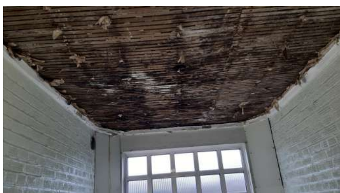
Ceiling in a stairwell in flats owned by Richmond Housing Partnership

Complaints about a deteriorating repairs service and poor estate management by RHP are growing, affecting individuals and communities. Too many residents are living in insecure, non-decent homes in conditions of disrepair which affects their health, safety, and well-being.